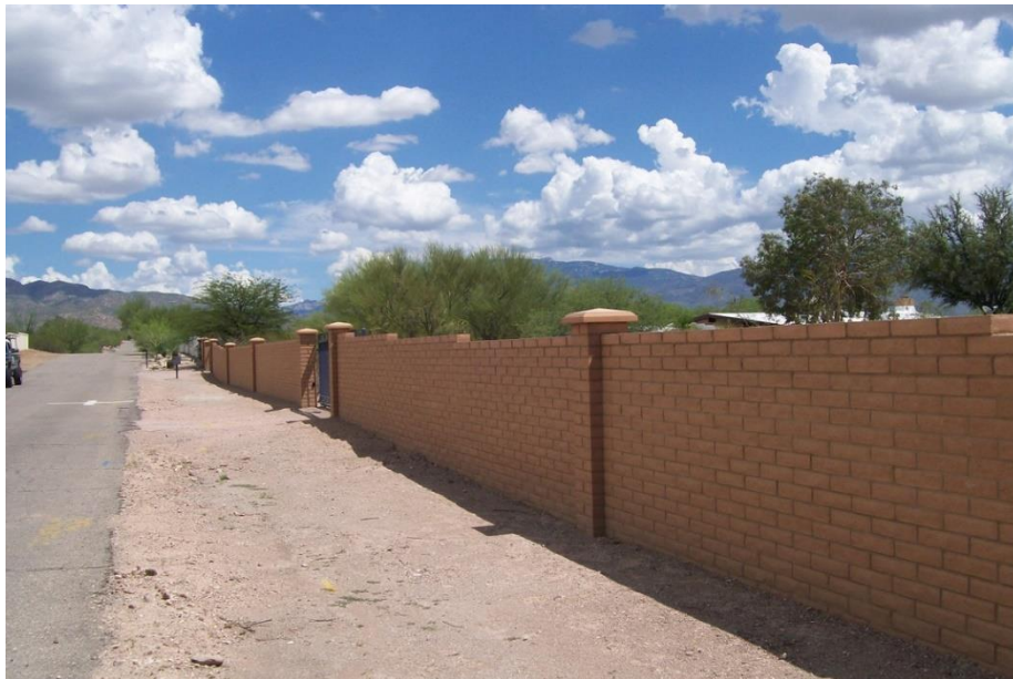
Figure 3 – Simulation of the Perimeter Wall from KOP #2

Figure 3 simulates the general look and feel of the perimeter wall from KOP # 2: