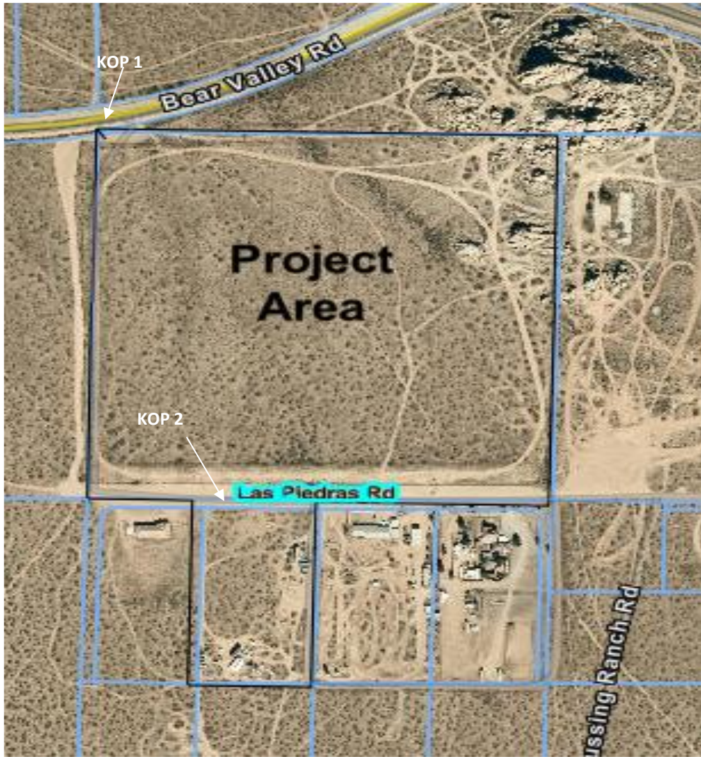
FIGURE 4 PROJECT AREA KOPs