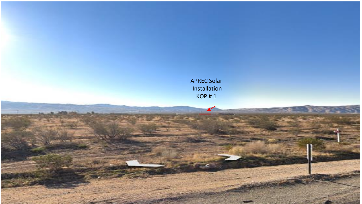
Figure 1 – View of the Proposed APREC Solar Installation from Bear Valley Road

Figure 1 below is the actual view from Bear Valley Road (KOP #1) looking south at the proposed installation. A rectangular line has been superimposed upon the photo to illustrate the proposed 6' wall and its visibility from the road. All solar components located behind the wall will be placed below the wall line and not visible from positions to the north.