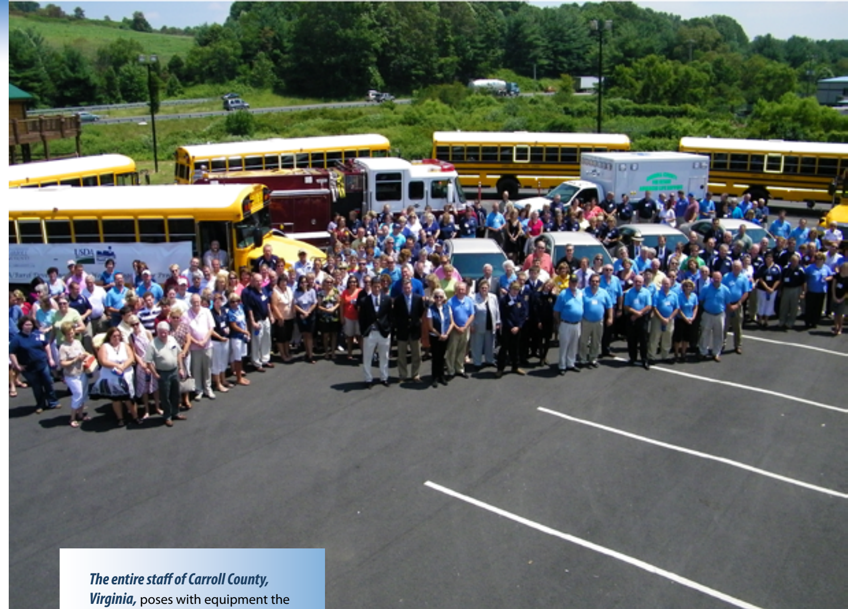
The entire staff of Carroll County, Virginia, poses with equipment the county has obtained through the Community Facilities Programs.

The community of North Logan and the residents of Cache County, Utah, were in need of a clinic. USDA Rural Development provided a loan to purchase a building to house the Cache Valley Community Health Center. The Center is a unique "one-stop-shop" facility that serves the uninsured, underinsured, and the insured. Low-income families are charged on a sliding scale, dependent on family size and income. The Center offers multiple methods of care, including a full-time pharmacy, preventative and primary medical care, dental treatment, and behavior health services.