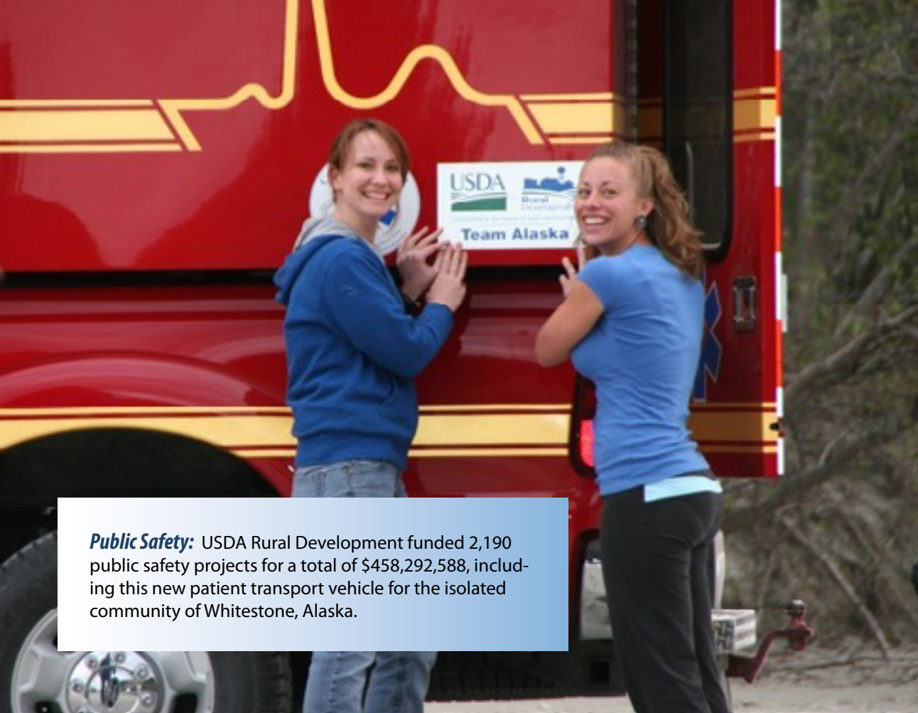
Public Safety: USDA Rural Development funded 2,190 public safety projects for a total of $458,292,588, including this new patient transport vehicle for the isolated community of Whitestone, Alaska.

project, the new Malta Medical Center includes exam rooms, dental stations, and medical, dental, and x-ray equipment. The center, which is the only primary care facility in Morgan County, schedules 20,000 to 25,000 patient visits per year. As a result of the increased demand for services, nine new positions have been added to Muskingum Valley's staff.